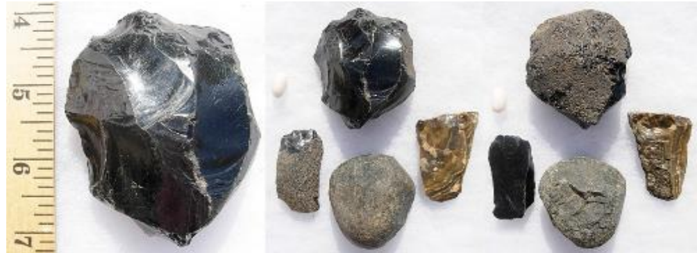
Stone artifacts from Oregon.