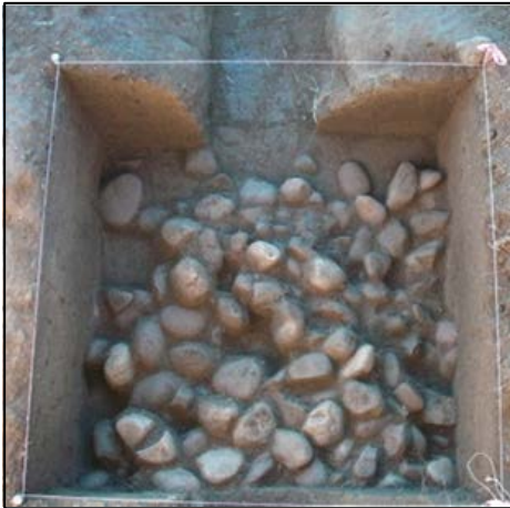
Underground oven.