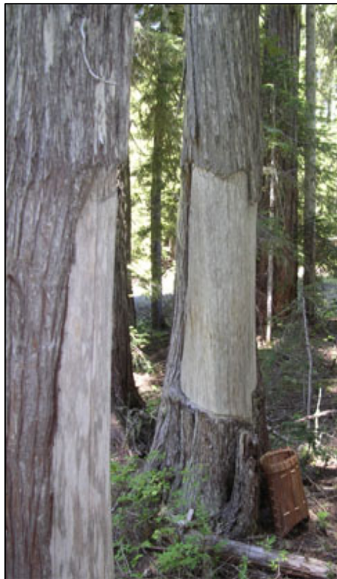
Left and Below: Culturally modified tree and an old carving on an aspen (Courtesy of DAHP).