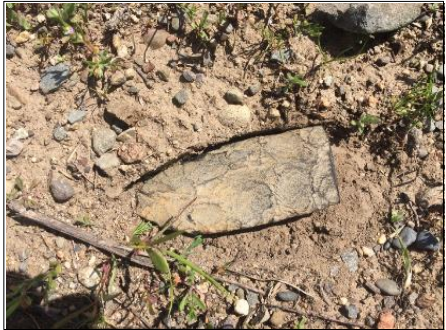
Biface-knife, scraper, or pre-form found in NE Washington. Thought to be a well knapped object of great antiquity.