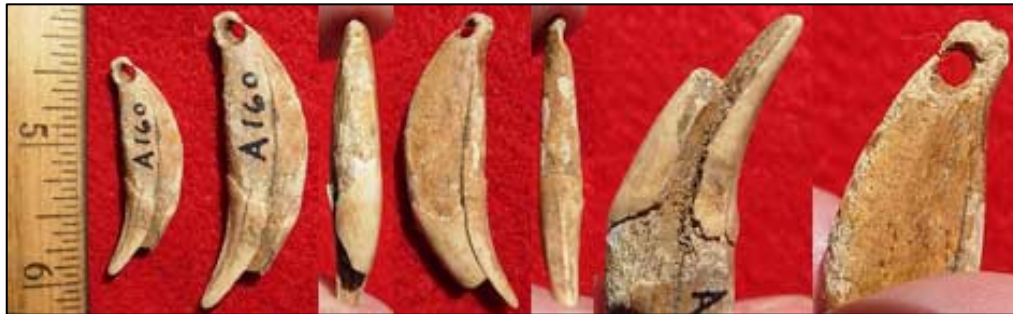
Upper Left: Bone Awls from Oregon.