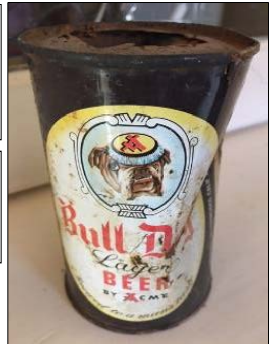
Right: Old beer can found in Oregon. ACME was owned by Olympia Brewery.