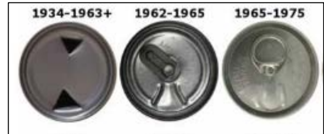
Can opening dates, courtesy of W.M. Schroeder.