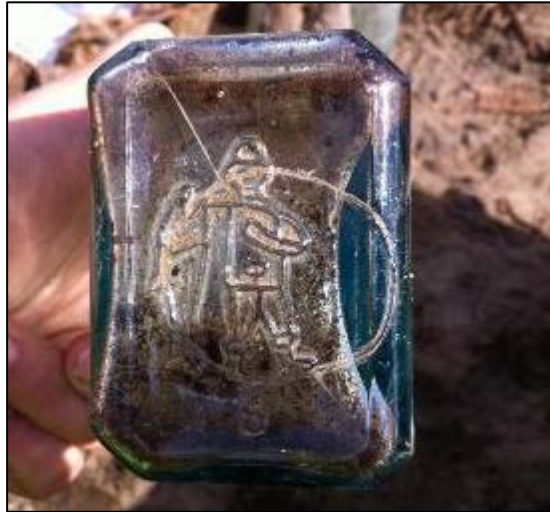
Far Left: .303 British cartridge found by a WCC planting crew on Skagit River. Don't ever touch something like this! Left: Maker's mark on bottom of old bottle.